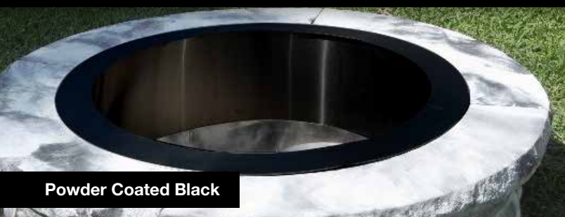
Powder Coated Black